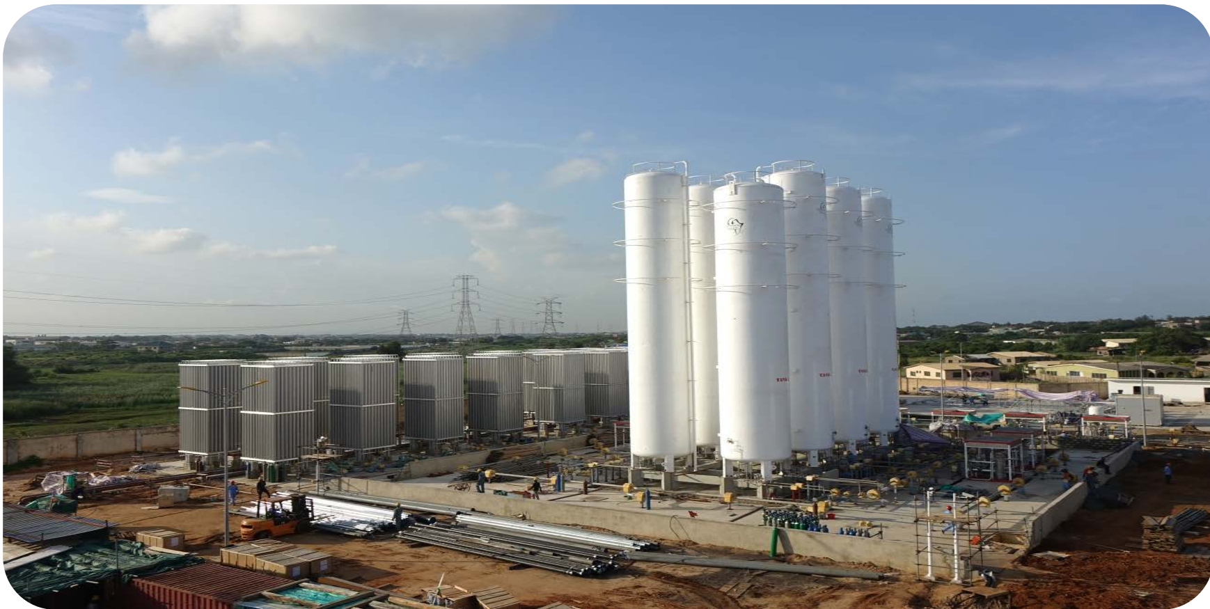
Completed LNG Regasification Station