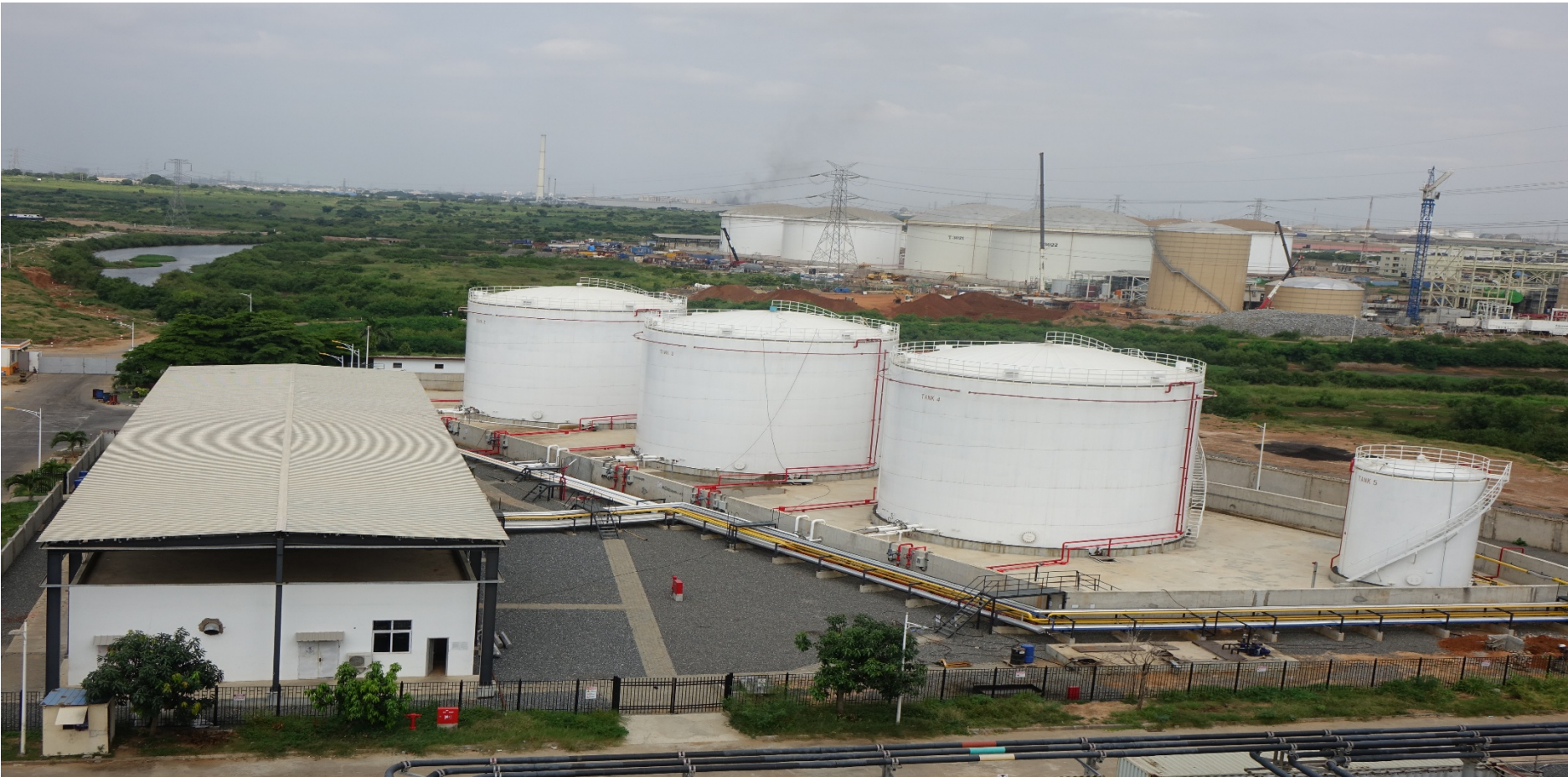
LCO Tank Farm