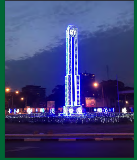
Monument de la République Togolaise (Monument of the Republic of Togo)