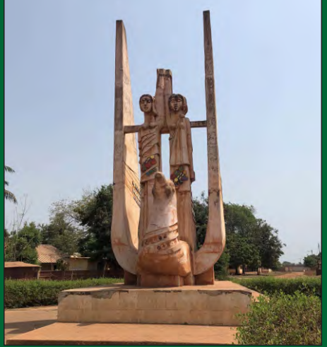
Monument to friendliness between the German and Togolese people