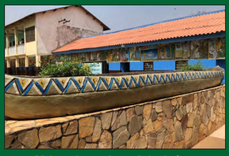
Maison des esclaves Agbodrafo