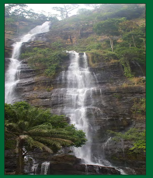
Kpalimé water falls